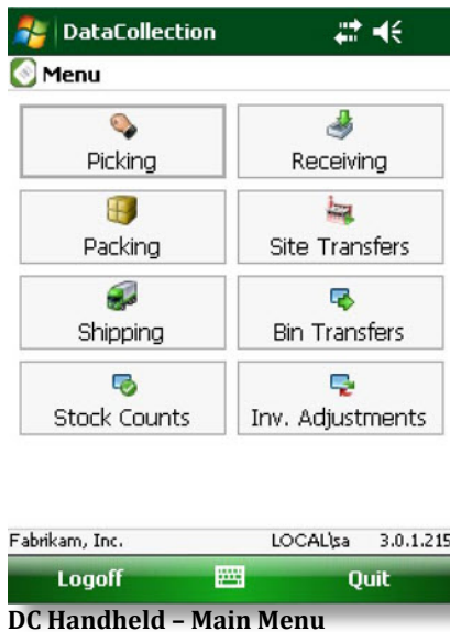
DC Handheld – Main Menu